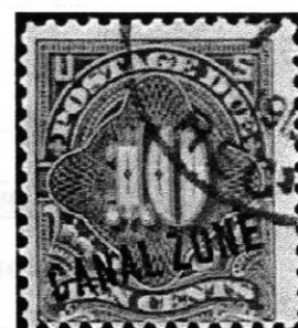
U.S. CANAL ZONE SCOTT J3