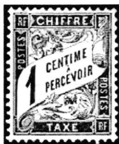
FRANCE SCOTT J11