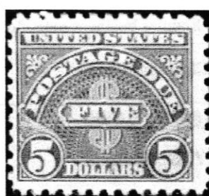
UNITED STATES SCOTT J78