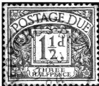
GREAT BRITAIN SCOTT J3