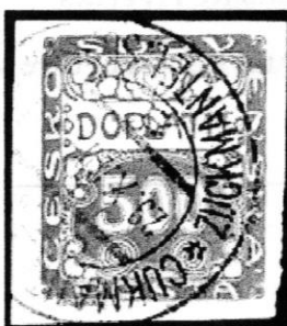
CZECHOSLOVAKIA SCOTT J12